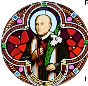
Left : St. Clement Hofbauer