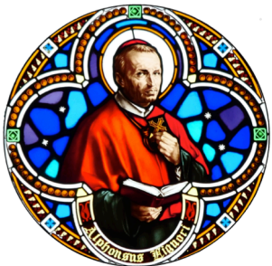
Left : St. Alphonsus Liguori

This week, we feature the specially commissioned stained glass display of our Redemptorist Saints.