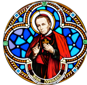
Right : St. John Neumann